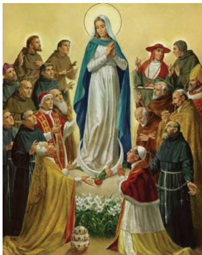
Queen of All Saints, Pray for us!